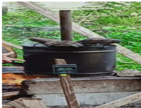
Figure 2 Drum and Temperature Measuring Equipment for Making OPEFB Biochar