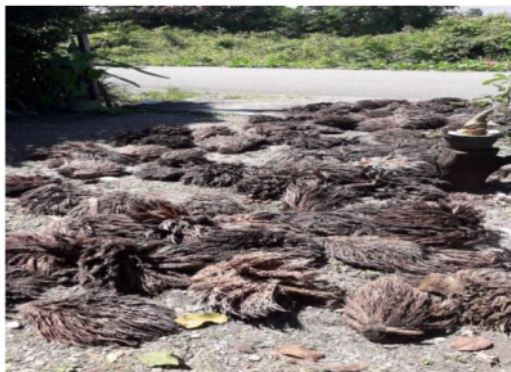
Figure 1 Oil Palm Empty Fruit Bunches