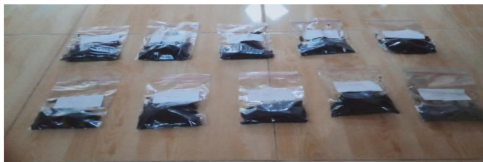
Figure 3 Oil Palm Empty Fruit Bunch Biochar

The main biomass components, including hemicellulose, cellulose, and lignin, were degraded during combustion. Each biomass directly influences the yield and characteristics of the resulting